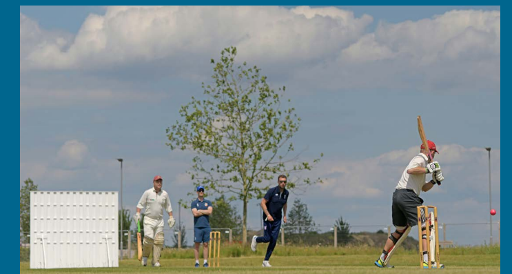
The Pavilion and Cricket Pitch host a range of fitness and sports events, from regular cricket games, to interbusiness tournaments, as well as football events, yoga and t'ai chi.