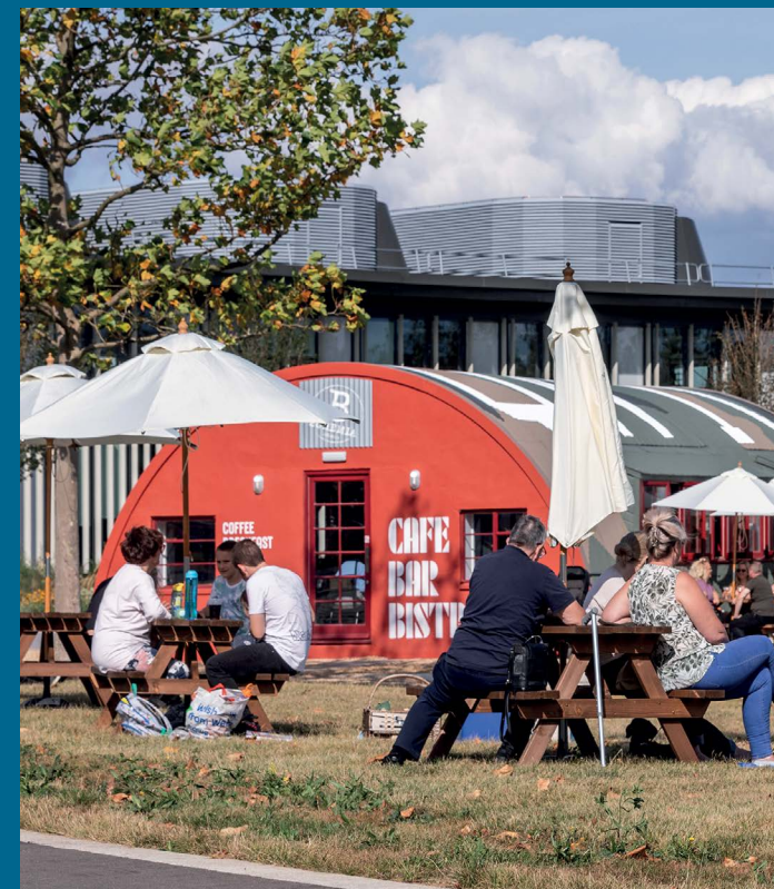
Relaxing outside the wartime Watch Office building

Alconbury Weald is not just a place to do business. It's a real community, a place to collaborate, a place to make friends, and a place to be inspired. With the development well into its first phase, and plans to deliver a total of 6,500 homes, four schools, a café, library, health centre, shops, gym, and 700 acres of woodland, parks and sports pitches, those who work here enjoy much more than just a first-rate business address.