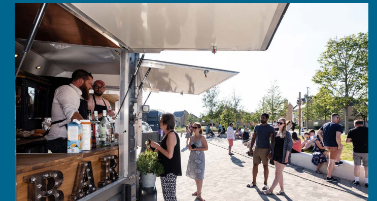
Regular pop-up food events serve the community two evenings a week and for regular events