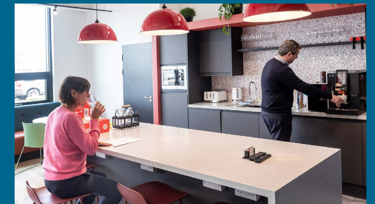
With over 800 families moved in, and 12 show homes open, the community is growing every day.

Alconbury Weald is not just a place to do business. It's a real community, a place to collaborate, a place to make friends, and a place to be inspired. With the development well into its first phase, and plans to deliver a total of 6,500 homes, four schools, a café, library, health centre, shops, gym, and 700 acres of woodland, parks and sports pitches, those who work here enjoy much more than just a first-rate business address.