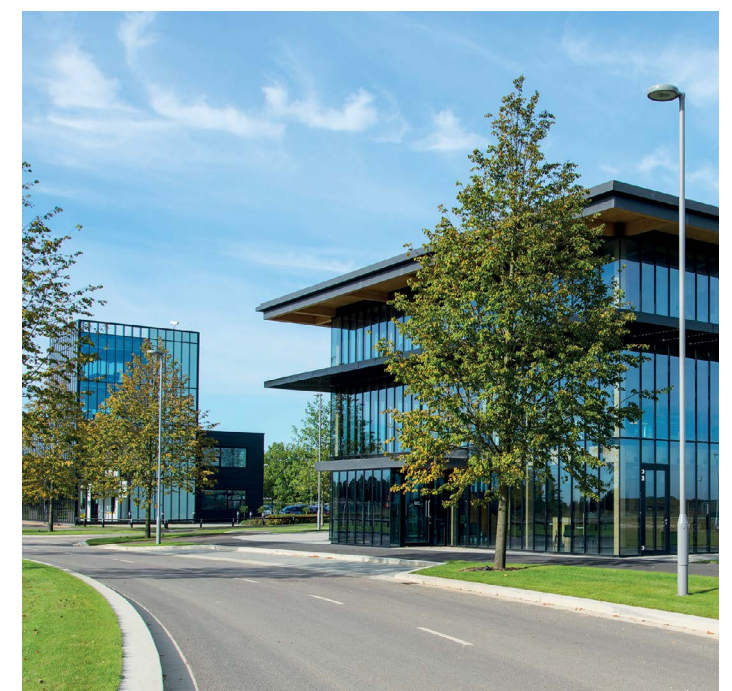
The Club, Urban & Civic's Alconbury Weald office also provides a gym, library, meeting and event space.

Companies already calling Alconbury Weald home include; Ambu plc, Roythornes Solicitors, Cambridgeshire County Council, Encocam; MM Flowers Ltd, John Adams Leisure Ltd, AM Fresh and IKO Insulations UK Ltd. Alconbury Weald is a location where all the foundations for growth are already in place.